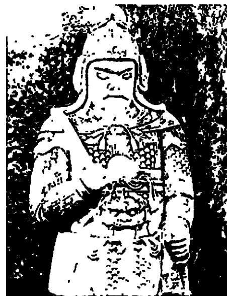
Stone statue—Ming Tombs, Peking.