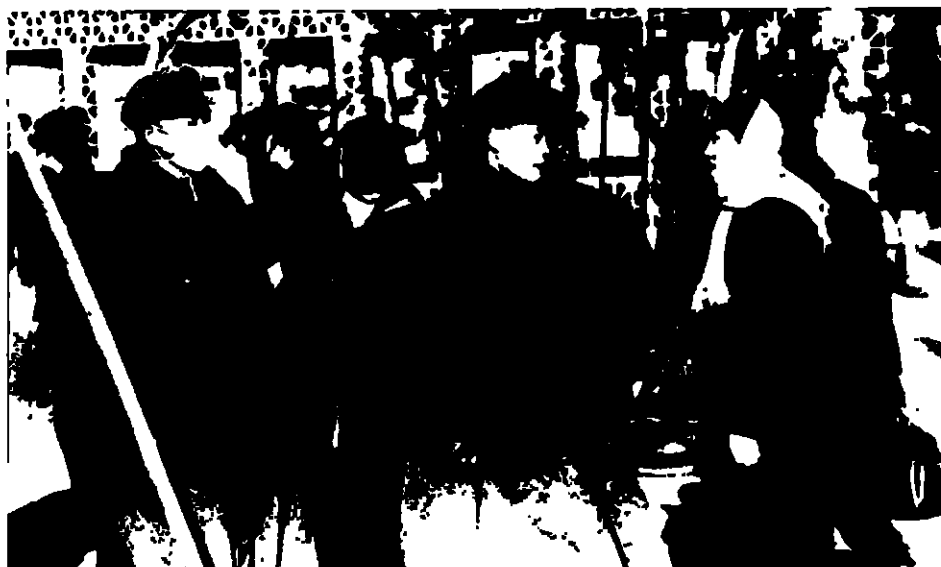
American linguists visit China. See article on page 3.